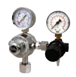
STANDARD REGULATOR CO, ADJUSTABLE